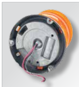
Permanent / 1" pipe mount bottom