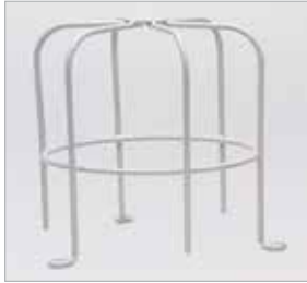
448330 Branch Guard option