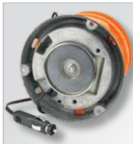
Magnetic mount bottom with cigarette plug