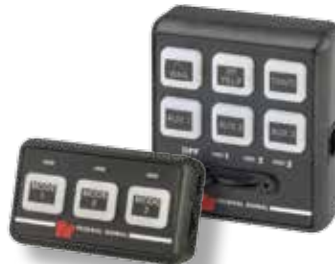
3- and 6-button controller