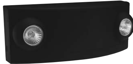
Optional black finish