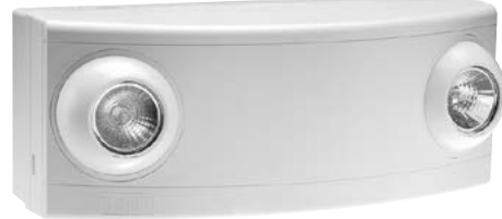
30 Watt Capacity with deep housing