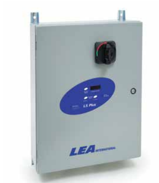
LS Plus Series

The LS Plus is a compact modular surge protection device. This unit is listed to UL 1449 4th Edition using thermal protection to maintain performance ratings. The LS Plus is designed to be installed quickly and serviced easily to eliminate downtime. A robust surge capacity up to 300 kA and fully loaded diagnostics package make this a versatile SPD for any application.