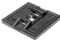
Standard Universal Surface Mount