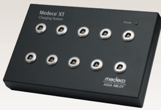
Multi Key Charger