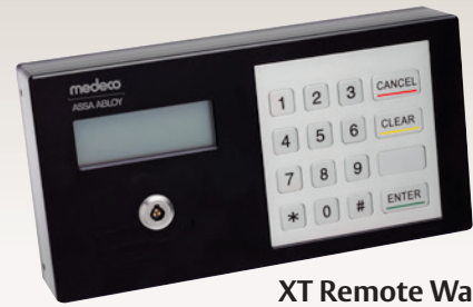
XT Remote Wall