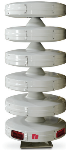
Shown with optional QuadraFlare lights