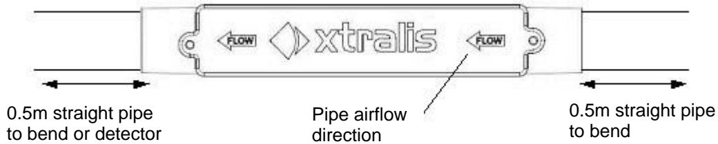
Figure 2: Xtralis In-Line Filter (Top View) – Horizontal Installation

The arrows on the Xtralis In-Line Filter cover indicate the direction of the pipe airflow (Figure 2). The filter should never be subjected to reverse flows.