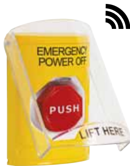
Stopper® Station Shield (Cover 2, A)

Covers to protect your STI Stopper Station from damage or weather and to help stop malicious or accidental activation.