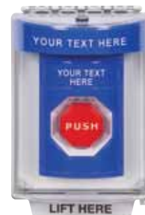
Universal Stopper® (Covers 3, 4, 7, 8)

No labeling can be placed on the Stopper Station shield.