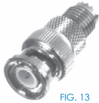
FIG. 13 RFU-627