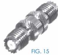
FIG. 15 RFU-629