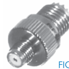
FIG. 22 RFU-642