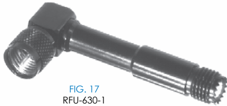
FIG. 17 RFU-630-1