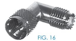
FIG. 16 RFU-630