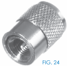
FIG. 24 RFU-645