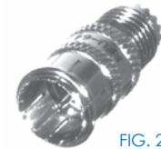
FIG. 23 RFU-643