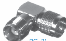
FIG. 21 RFU-633