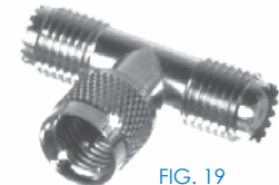
FIG. 19 RFU-631