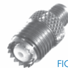
FIG. 27 RSA-3471

PHOTOS FOR REFERENCE ONLY, SHOWN AT 100% ACTUAL SIZE.