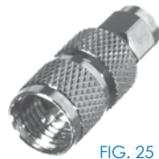
FIG. 25 RSA-3451