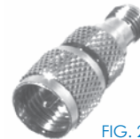
FIG. 26 RSA-3470