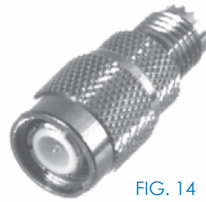
FIG. 14 RFU-628