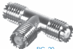
FIG. 20 RFU-632