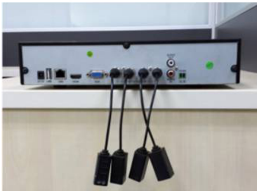
Old baluns make the cabinet a mess