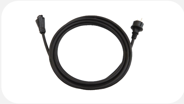
Plug and play Cable