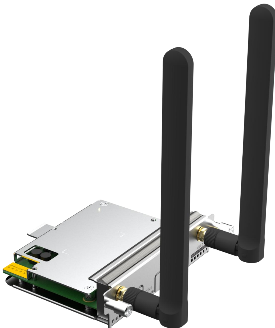
Figure 1-1 Appearance of the RG-NSEC-SIC-LTE-S