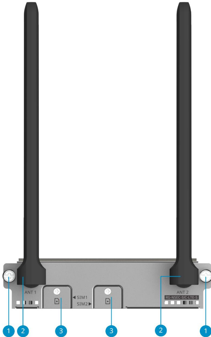
Table 1-1 RG-NSEC-SIC-LTE-S Faceplate Description