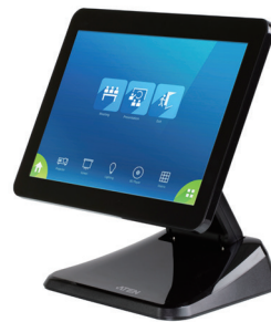
VK330 + VK304