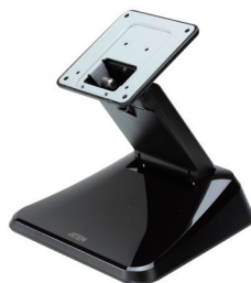
VK304 (Tabletop Kit)